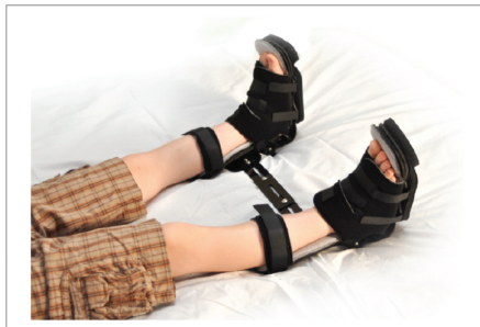
RAPO™ Orthoses with Abduction Control Kit Product # 550RTBS shown with bilateral orthoses. Abduction Control Kit # A50PW