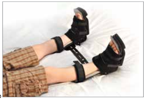
RAPO™ Orthoses with Abduction Control Kit Product #450RTBS shown with bilateral orthoses Abduction Control Kit #A50PW