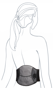
MODEL 117 BELLAIRE*