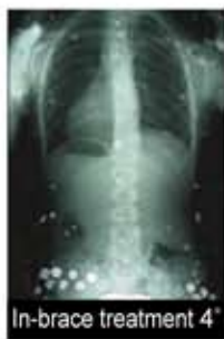
In-brace treatment 4°