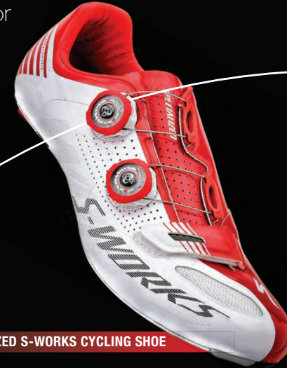
SPECIALIZED S-WORKS CYCLING SHOE