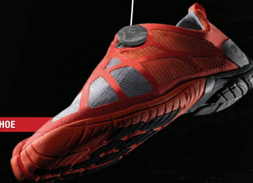
TOPO ATHLETIC M-RR RUNNING SHOE

Drawing from over 10 years of experience creating closure solutions for high performance sporting good brands, Boa has applied its technology to medical bracing products from Exos Medical, Ossur, Futuro, Ace and DeRoyal. Our newest partnerships with Hanger and Revolimb deliver the same premium closure solutions to orthotics and prosthetics. The proven fit, convenience and single-handed micro adjustment of Boa Technology consistently deliver outstanding benefits to both patients and providers.