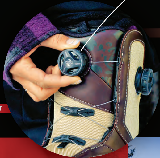
K2 CONTOUR SNOWBOARDING BOOT