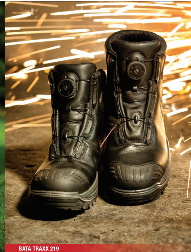
BATA TRAXX 219