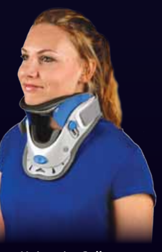
University Collar Approved L0172