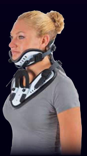
CyberSpine Cervical Orthosis Approved L0180