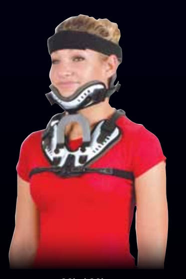
Mini Minerva Approved L0190