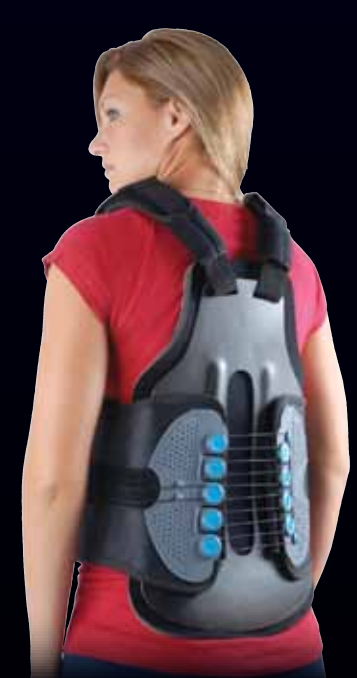
Cyberspine TLSO Approved L0460