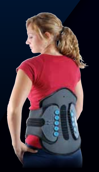
Comprehensive LSO Approved L0631