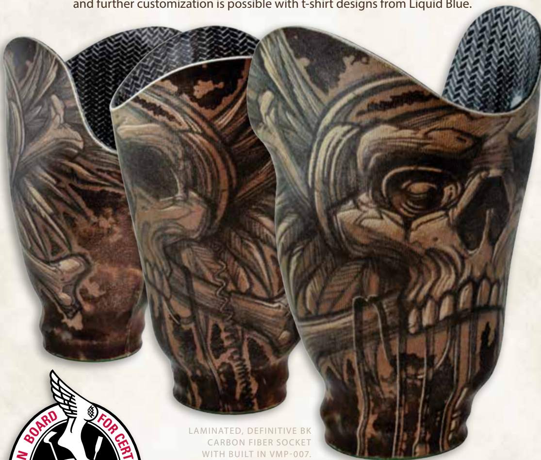
LAMINATED, DEFINITIVE BK CARBON FIBER SOCKET WITH BUILT IN VMP-007.

Evolution specializes in lower extremity sockets. All of our definitive sockets are made from a special weave and weight of premium grade carbon fiber that results in a lighter, stronger socket your patients can count on day after day. They are available in a variety of skin tones, carbon fiber black, and further customization is possible with t-shirt designs from Liquid Blue.