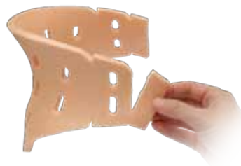
Tear-off circumference adjustments