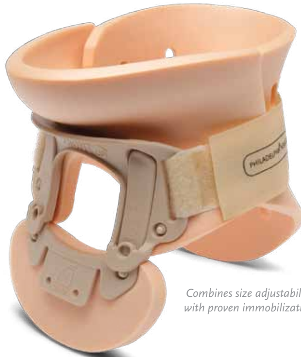
Combines size adjustability with proven immobilization