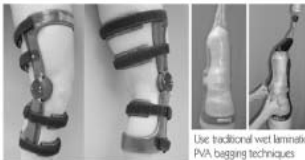
Use traditional wet lamination PVA bagging techniques

Now available direct or through PEL Supply and BECKER