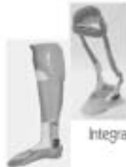
Integrate any industry standard Knee or ankle joint