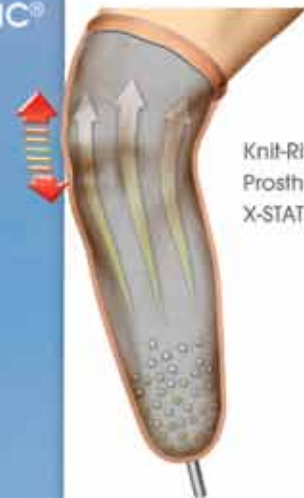
Knit-Rite Liner-Liner® Prosthetic Sock with X-STATIC®