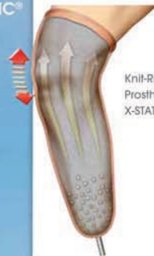
Knit-Rite Liner-Liner® Prosthetic Sock with X-STATIC®