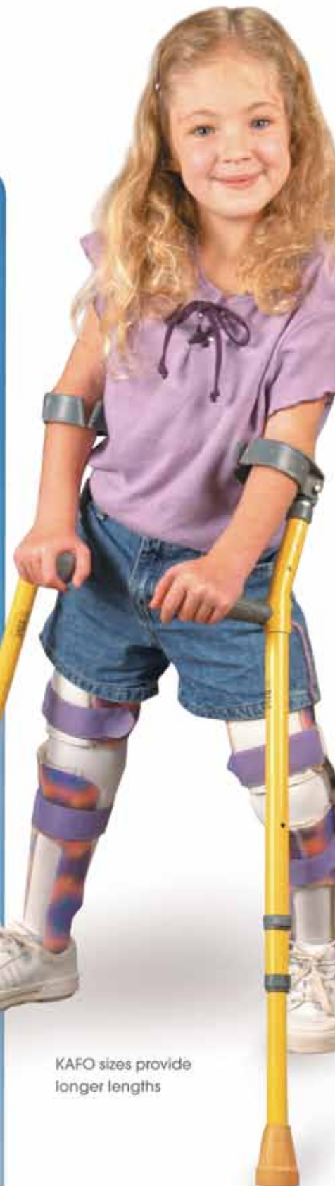
KAFO sizes provide longer lengths