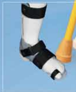
SmartKnit Big Toe Sock