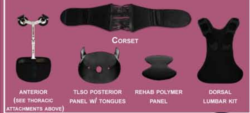
ANTERIOR (SEE THORACIC ATTACHMENTS ABOVE)