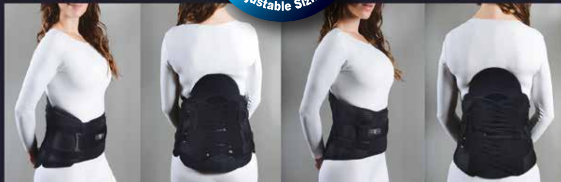
PDAC APPROVED L0631, L0637 & L0456