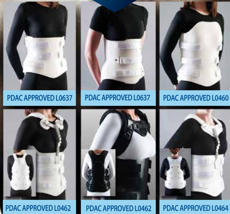
PDAC APPROVED L0637