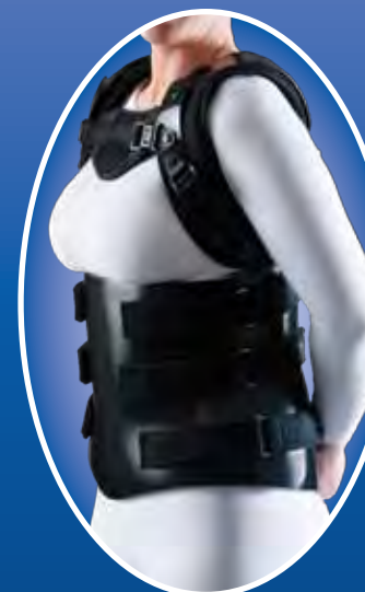
TLSO w/ DLK