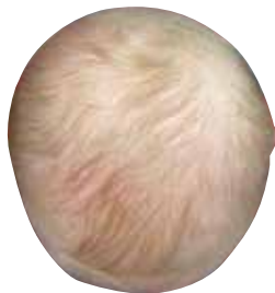
After STARband Treatment