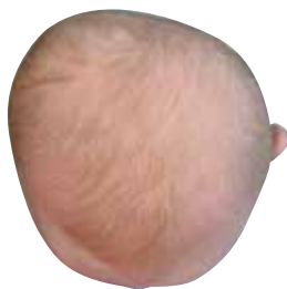
Before STARband Treatment