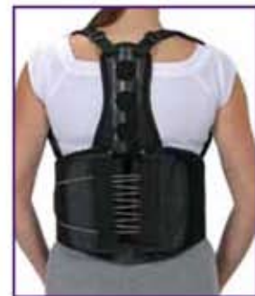
California ECO™ L0456 Approved

ORTHOMERICA® 800-446-6770 | orthomerica.com