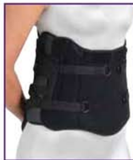
California® "Original" L0637 Approved