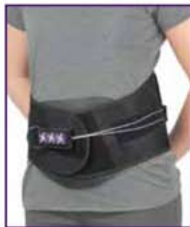
California® Ventura™ L0631 Approved

Compound Closure adjusts to hip development and circumference— one-hand pull.