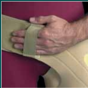
Hand loop eases application and closure.