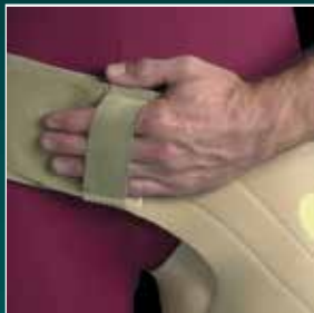
Hand loop eases application and closure